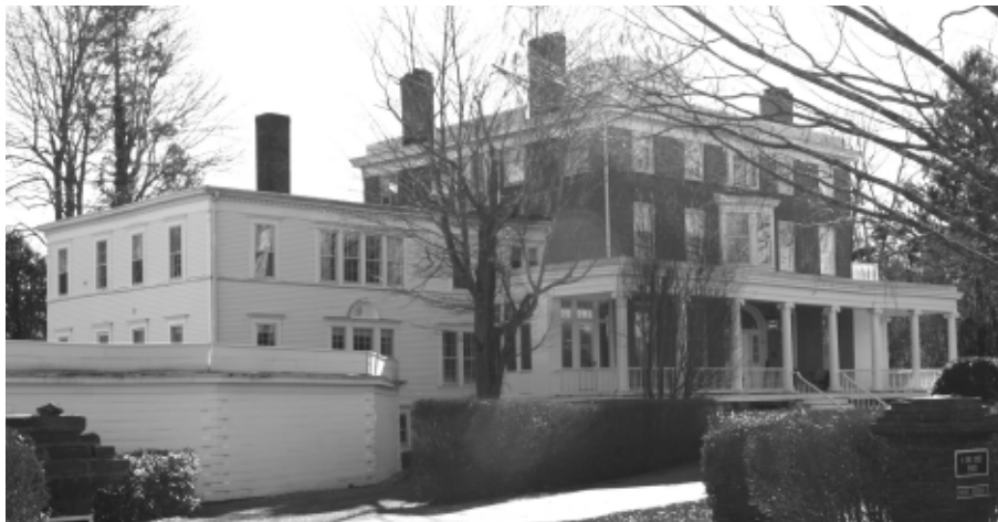
Boxwood Manor Inn, 2013