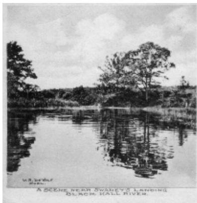
A scene near Swaney's Landing, Black Hall River, circa 1909.