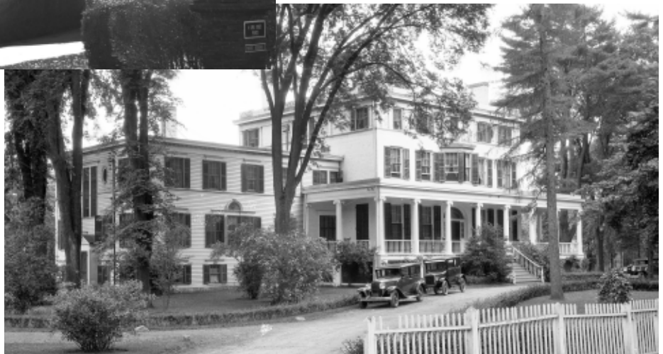
Boxwood Manor Inn, circa 1928